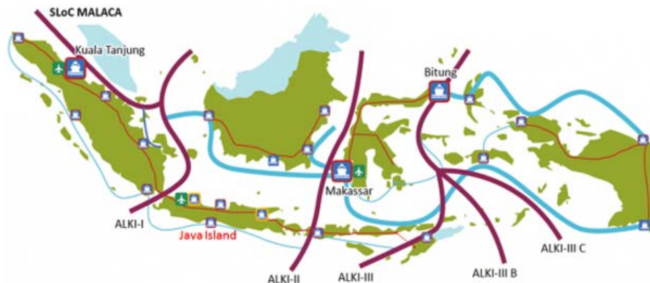
Fig. 1 IASL [11]

of linguistic and visual data collection. Data are obtained from the analysis of documents and regulations.