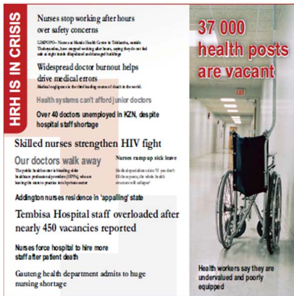
Fig. 2 Challenges Facing Human Resources for Health, adapted from [6]

The following section will give recommendations to the factors that contribute to data integrity issues and if applied can assist to manage data integrity challenges.