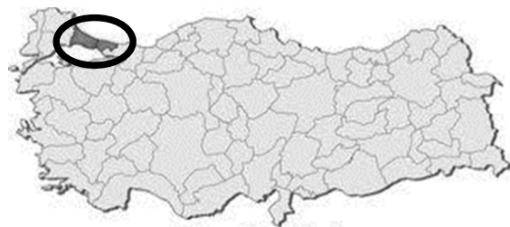
Fig. 1 Location of Istanbul, Turkey

The main features of the Mediterranean climate are extreme summers since there are mild-winter conditions. In such a climate, one of the influential parameters can be shading devices which are the perfect solution to protect from rain and take advantage of sunlight during the winter while avoiding it during the summer. Natural ventilation is another important parameter for common usage spaces which is achieved by suitable orientation and openings. For example, west and east-facing windows are small to protect from sunlight during summer days, but large north-facing windows lose heat due to being located on shaded sides and directly affected by harsh and cold winds; however, proper windows should have a suitable size, provide daylight, desirable air circulation, and a good view. Common usage spaces are usually located in the southern section of buildings to maximize the benefits of sunlight through large windows [14], [15].