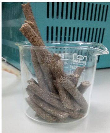
Fig. 1 Residue of aniseed after cold press extraction

Step2. Milling of Herbal Material after Cold Press: Aniseed herbal material was milled by blender about ten minutes.