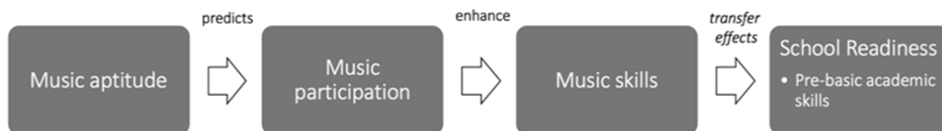
Fig. 2 Hypothetical Relationship between Music Aptitude and School Readiness

drawn into more musical activities. The exposure of music activity will develop and enhance their music skills. During this process, the transfer effects occur, where the children may carry over the skills learned in music into other domains, such as the academic skills. On the other hand, children with low music aptitude may not be as drawn into musical activities as their counterparts. Less exposure of music activity will potentially hinder the development of their music skills. Therefore, the possibility for transfer effect to occur is low. This assumption shows that music exposure may play an important bridging role in the relationship between music aptitude and school readiness. Considering that there might be an indirect relationship between music aptitude to school readiness, further investigation is recommended.