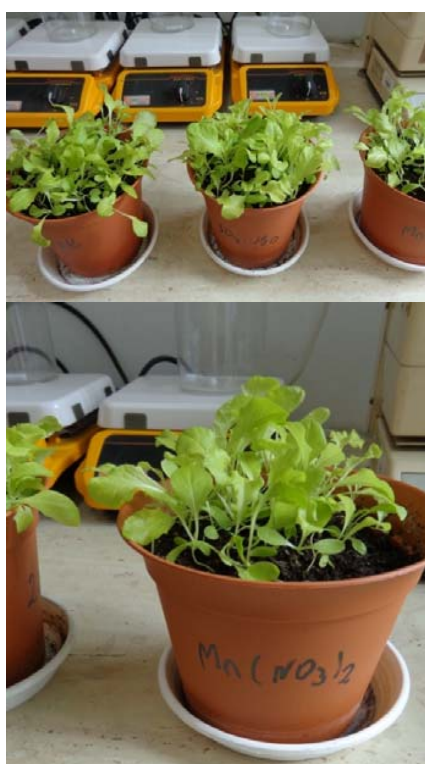
Fig. 2 An experiment of a Lettuce

Our plant research has been implemented of wetland soils based on the Colchis (Poti, Georgia) Agricultural-Ecological Experimental Station to explore the use of manganese-containing micronutrient produced from industrial waste for raising the fertility for chemical amelioration of wetland soils.