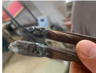
Fig. 2 Sizes of Weld Used

testing setup, and tested samples are shown in Figs. 4-7 respectively. This machine is a displacement based UTM for tensile testing. Loading is applied at a displacement rate of minimum 2 mm per minute to a maximum of 10 mm per minute as shown in Table II.