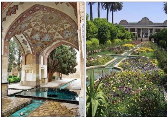
Fig. 4 Fin Garden/Eram Garden, Iran [9]