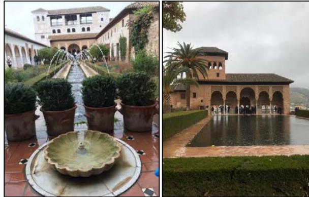
Fig. 1 Alhambra, Generalife, Granada/Spain (Original, 2019)

ornamenting the garden area. Islamic gardens emerged with the combination of “water” and “plants”, generally in arid regions. The contradiction between the desert and the garden was depicted as the creation of gardens representing the paradise in arid regions, as well as an example for the prosperous view of the same.