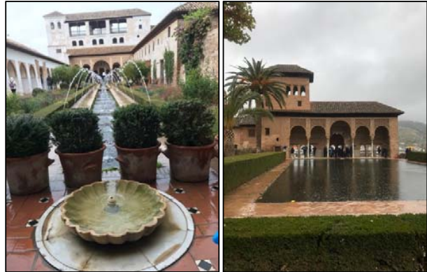
Fig. 1 Alhambra, Generalife, Granada/Spain (Original, 2019)

ornamenting the garden area. Islamic gardens emerged with the combination of “water” and “plants”, generally in arid regions. The contradiction between the desert and the garden was depicted as the creation of gardens representing the paradise in arid regions, as well as an example for the prosperous view of the same.