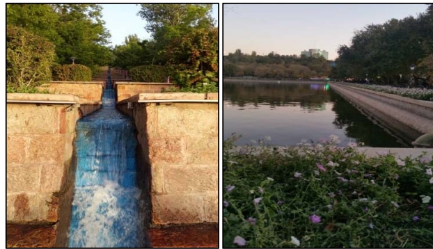
Fig. 2 Shahgoli Park, Tabriz/Iran (Original, 2019)