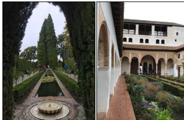
Fig. 5 Alhambra, Generalife, Spain (Original, 2019)

In the gardens of Spain, elegant and thin columns surrounding the courtyards, circle and horseshoe-shaped arches, geometric stone adornments, tile flooring were the most prominent architectural features. One of the most important features of these gardens was the use of water. Water elements are sometimes used as a long channel in rectangular, polygonal, square pools surrounded by semi-circles. In order to give movement and sound to the space, the water channels are surrounded by sprinklers arranged rhythmically.