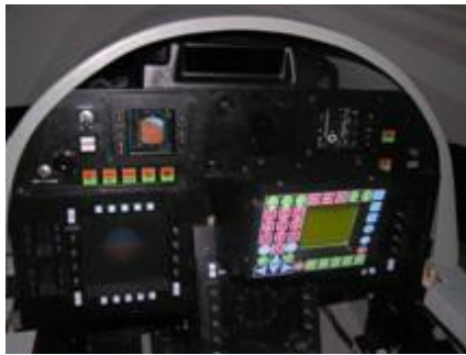
Fig. 2 MWAS

The simulators based on the embedded algorithms are primarily used for training purposes to execute various missions and tasks in the operational scenarios [8]. The flight simulators are also used with an aim of making pilots adapt to new technologies. This can be also used as a research platform to evaluate pilot's decision-making capabilities in various operational scenarios. The simulation technologies also help to understand the mental, physical and emotion characteristics of the pilot using the human-in-loop simulation setup. The mental workload assessment simulator (MWAS), as shown in Fig. 2, at the Defense Research and Development Organization (DRDO), is used to capture real time data for mental workload studies [9], [10]. The data collection during simulated scenarios with human-in-loop helps in building a statistical model to quantify the pilot workload for a given mission or task. The engineering flight simulator (EFS), as shown in Fig. 3, at DRDO is used to develop pilot vehicle interfaces for military platforms [11].