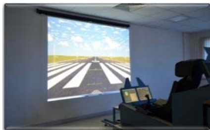
Fig. 3 EFS for PVI research

The objective assessment tools provide instructors with a net set of information which contains flight parameters fused with the psychophysical state of the pilot [12].