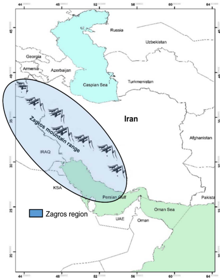
Fig. 1 Location of the study region (Zagros) in Iran

observed in groundwater and precipitation data. In the eastern and northern part of Zagros region, D excess demonstrated more depleted values compared to precipitation followed by depleted \delta^{18}O and \delta^2H values and demonstrated groundwater recharge by high elevation precipitation. In contrast, in central part of Zagros region, more enriched value of D excess is followed by more depleted \delta^{18}O and \delta^2H due to groundwater recharge by high elevation precipitation which is generated from cold region. However, local precipitation influenced by secondary evaporation depicted depleted D excess. Secondary evaporation observed in local precipitation in this region was also in close agreement with hot and semi-dry climate dominated in this part of Iran.