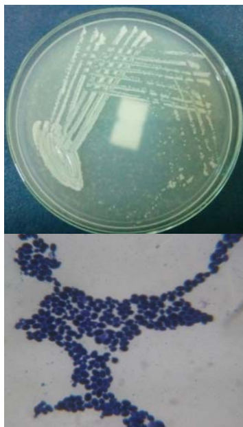
Fig. 2 Cultural and Microscopic Morphology of Saccharomyces cerevisiae