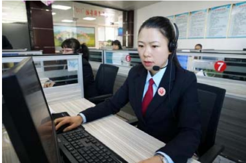
Fig. 2 Staff of home care information service center of Daitian Zehui is tracking the elderly service objects

survey and other forms of evaluation and scoring, service providers or service personnel of poor service quality resolutely gives search method, and timely expansion of new service providers and service personnel. At present, the center has been certified by ISO9001 quality management system.