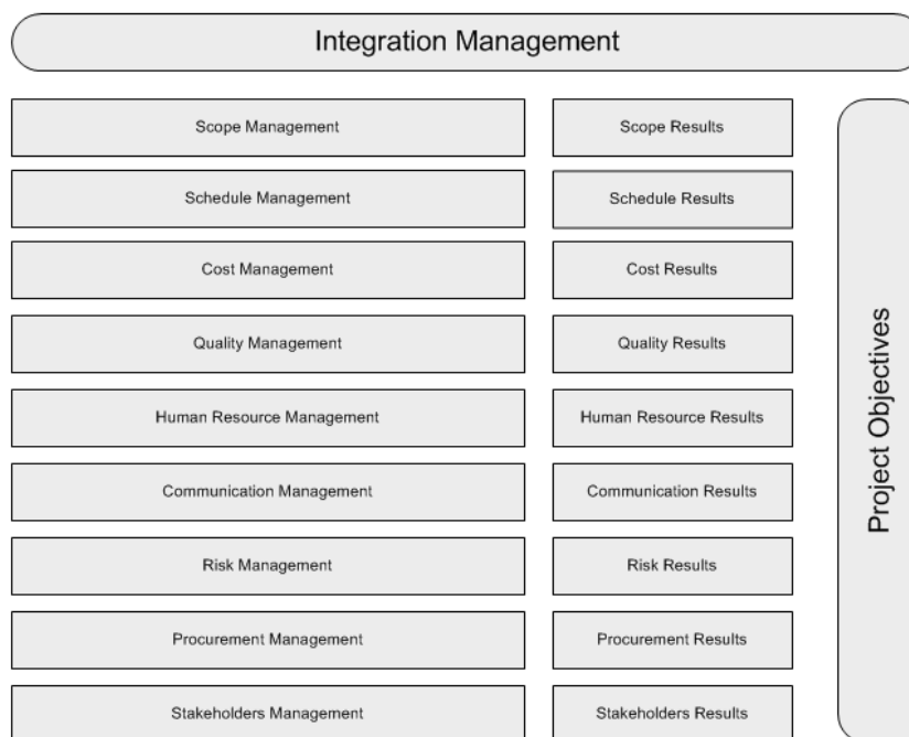
Fig. 1 The mental model of POS

POS model is defined as a set of measurements that give top managers a fast, but comprehensive view of the project objectives including tangible measures on PMBOK knowledge areas. Nowadays, project managers need to view performance in several areas simultaneously. POS Model does this by providing information from nine perspectives: scope, time, cost, quality, human resource, communication, risk, procurement and stakeholders. This concept helps to implement integration management in PMBOK.