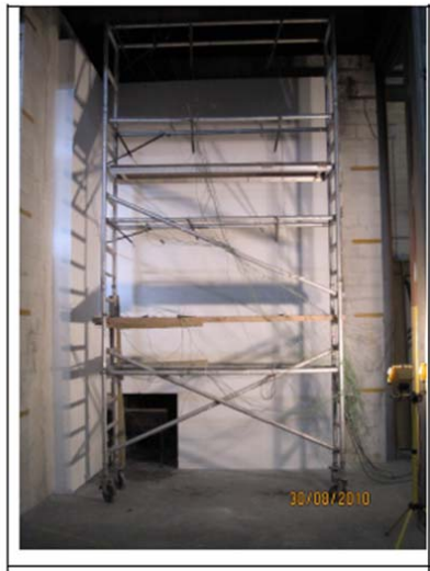
Fig. 2 DIN 4120-20 test rig

fire chamber. There is also no flaming allowed on the top of the specimen and no falling debris and droplets falling 90 seconds after the burners have been shut down [12].