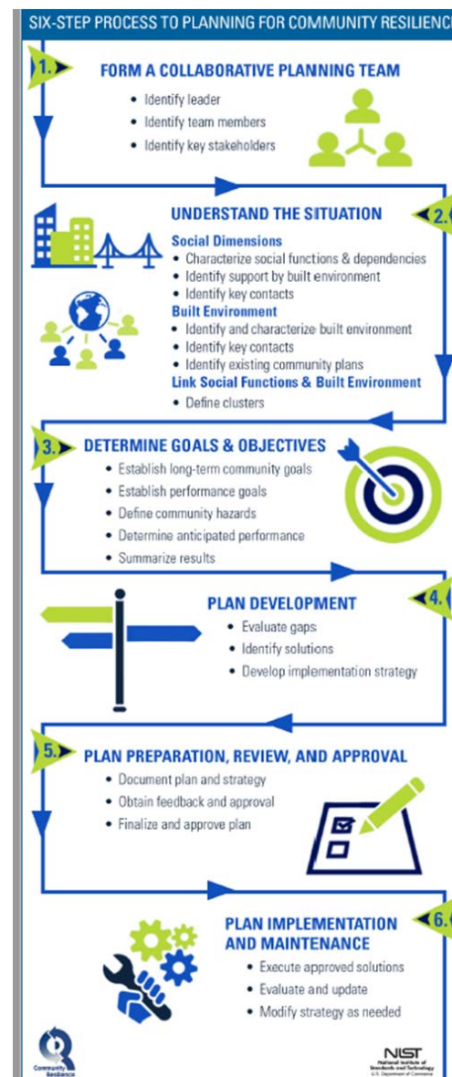
Fig. 4 NIST Community Resilience Planning Guide

parameter part of a much bigger picture.