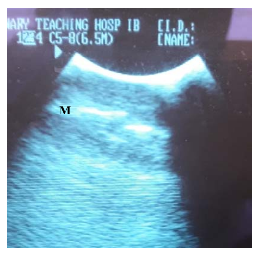
Fig. 4 Sagittal View of Rabbit Testes

The ultrasonographic images are represented by Figs. 3 and