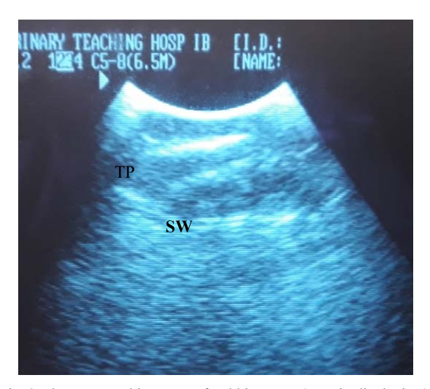
Fig. 3 Ultrasonographic Image of Rabbit Testes (Longitudinal View)