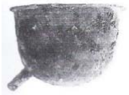
Fig. 3 Copper enema of Uah-ib-Ra [5]

In this research, the clyster belonging to the prophet of Amen Uah-ib-Ra (Fig. 3) has been used as main reference, due both to the parallelism and the extensive documentation, as well as the aforementioned copper reproduction of this object made by Janot [10].