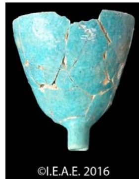
Fig. 4 The faience enema of the Tomb AT -28-

The faience also had for the Egyptians, as usual, a religious symbolism: blue symbolized life and vigor, and the promise of regeneration and rebirth, related to the cult of solar-type [9]. All this was closely related to the Osirian cults that focused mummification, based on the resurrection and that emulated the first mythological mummification practiced to Osiris.