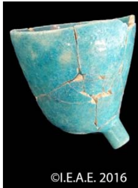
Fig. 1 Faience enema of the Tomb AT -28-

The second fundamental task has been to establish hypotheses about the use of the faience for its construction, for which the works of Lucas [8] and Bedman [9] have been used, where the peculiarities of this material are detailed.