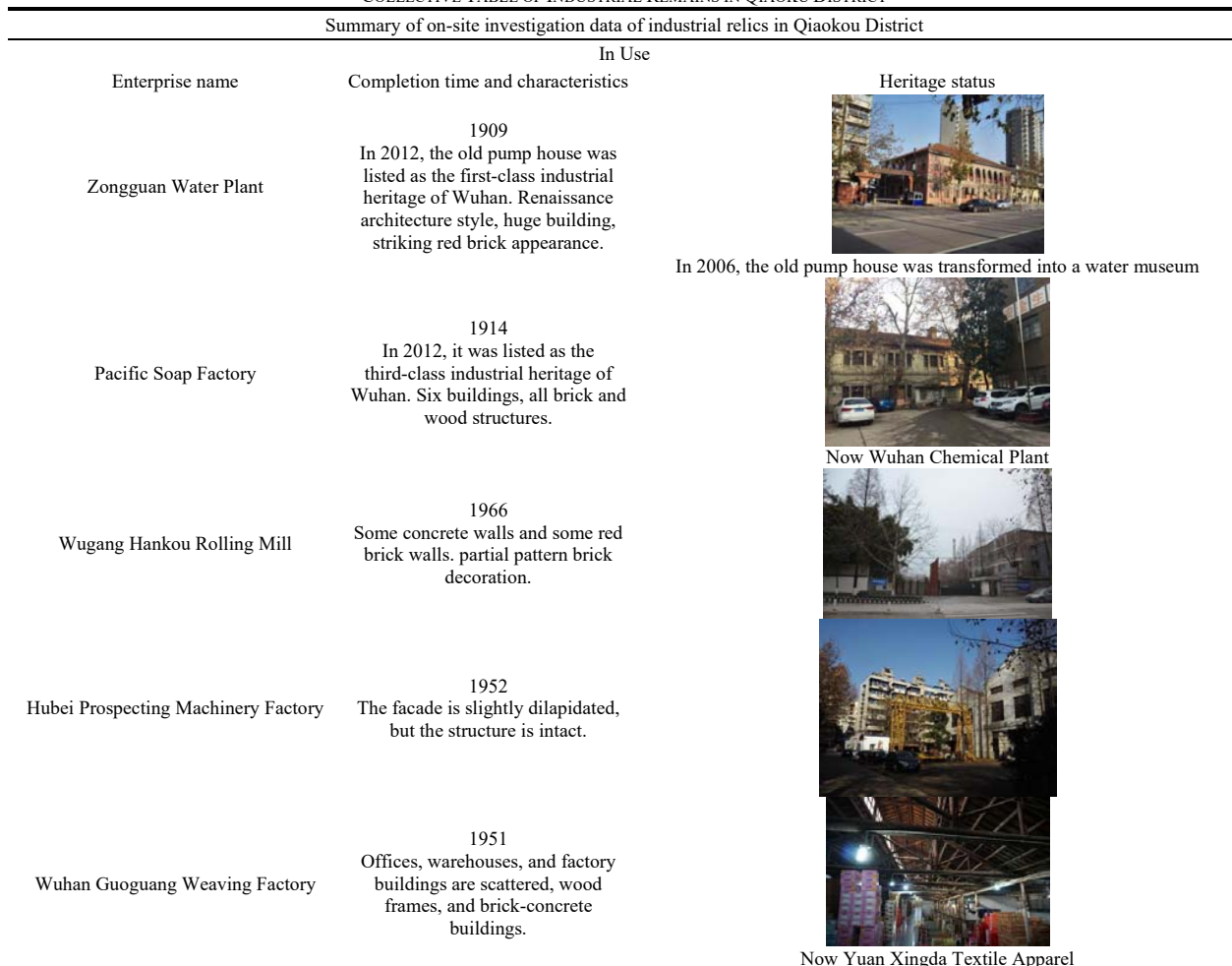
TABLE I COLLECTIVE TABLE OF INDUSTRIAL REMAINS IN QIAOKU DISTRICT Summary of on-site investigation data of industrial relics in Qiaokou District

Nowadays, there are only about a dozen industrial enterprises in the Qiaokou area (only Zongguan Water Plants, Nanyang Tobacco Factory and Hubei Prospecting Machinery Factory are still in use) from the peak period of nearly 200 to now [1]. Four of them have been renovated, two of them are idle, and some of them will be demolished after 2015. Details of the specific industrial remains are as follows: