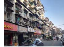
There's only one residential building left.

1952 Hubei Transportation Auto Parts Factory The factory building was demolished, leaving only a pale yellow residential building with a slightly dilapidated facade.