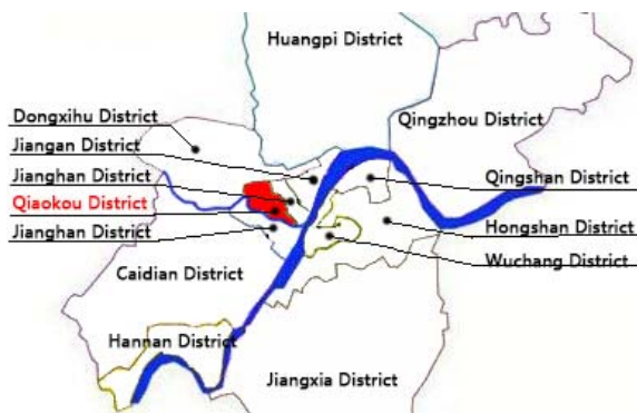
Fig. 1 Location and Regional Map of Qiaokou

Jiji Hydropower Plant (now the Zongguan Water Plant), the Fuxin Flour Mill (now the 1919 old Workshop), the Nanyang Tobacco Factory, and the Pacific Soap Factory; all of these 100-year-old factories were born and developed in the Qiaokou. The name of Zongguan is said to be based on the Zongguan Water Plant, especially the Gutian Industrial Zone, which was once the birthplace of the Qiaokou industry. At the beginning of the founding of the country, it was listed as one of the 156 national restoration projects. After decades of development, Gutian and its surrounding areas have gathered about 200 industrial enterprises, and Qiaokou has become a gathering place of the chemical industry and secondary industry. At the same time, it has caused damage and pollution to the city and become a marginalized area forgotten by the central city. However, with the acceleration of the "three old" transformation and the "shifting from labor-intensive industry to service economy" process in Wuhan, Qiaokou is also constantly reforming and innovating, and has begun to drastically carry out the transformation of the old city and the development of the new district, through large-scale demolition and transformation to achieve urban renewal, and to get space reconstruction and quality upgrades, in order to change the inherent image of the smoky and polluted area in the Qiaokou District.