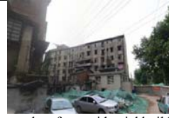
There are only a few residential buildings left.

1921 Shenxin Branch of Wuhan First Cotton Textile Group The factory was demolished in 2009, leaving only a few residential buildings with bare-faced concrete facades, which are now in ruins.