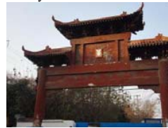
Only one archway left

1952 Wuhan Winery Only one single-span red lacquer archway remains; all the other factories were demolished in 2014.