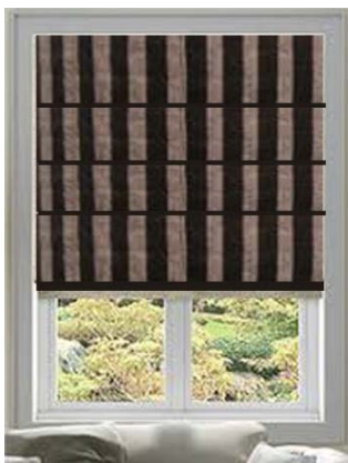
Fig. 21 Deccani Wool Gongadi as blind for windows