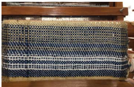
Fig. 15 Handwoven sample of twill weave using Gaddi wool