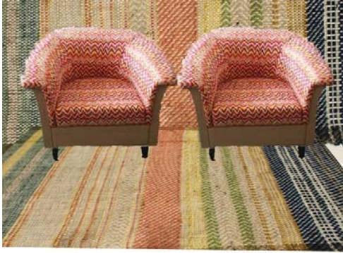
Fig. 19 Organic Gaddi wool as carpet, flooring, wall covering