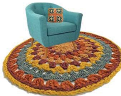
Fig. 18 Organic Gaddi wool Crocheted carpet and cushion