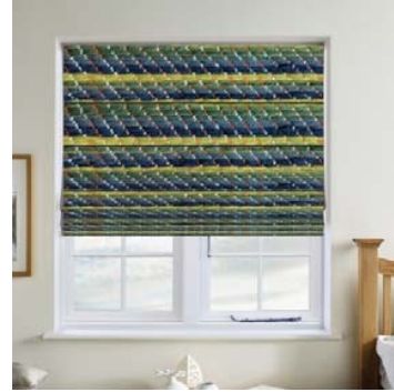
Fig. 23 Colorful blinds using organic Gaddi wool