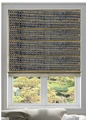
Fig. 22 Organic Gaddi wool used as window blind

The interior furnishings made out of the natural wool can also be used for wellness purposes.