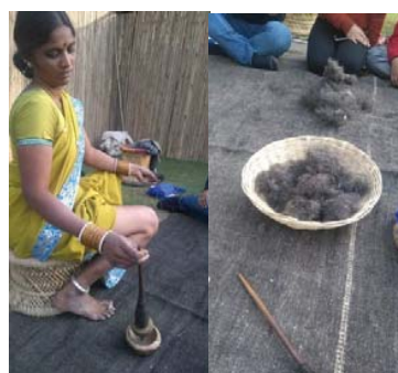
Fig.6 Spinning of wool using wooden spindle

In the warping process, the wool is wrapped on a structure consisting of seven pegs which is either fixed on the ground or on a hanging frame. The yarn is sized with tamarind seed paste thrice and then prepared for the heads of cotton thread that are made manually every time a Gongadi has to be woven [15].