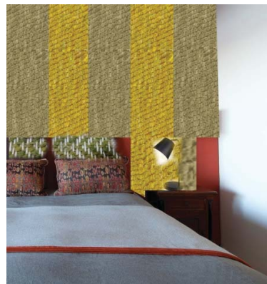
Fig. 25 Organic Gaddi Wool as wall paneling and cushions

The interior furnishings made out of the natural wool can also be used for wellness purposes.