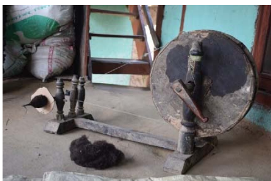
Fig. 2 Hand spinning wheel (Charkha)

the Charkha . Since this yarn is not very strong, it is twisted with wooden spindle called Katli to add strength to the yarn. The task of spinning is done by both the sexes using the drop-spindle method.