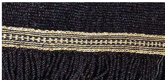
Fig. 8 Tummakaya Kada [10]