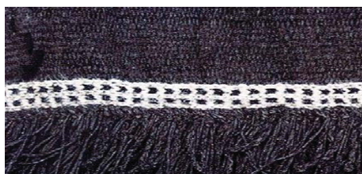
Fig. 9 Nimmakaya Kada [10]