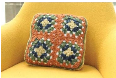
Fig. 27 Organic Gaddi wool crocheted cushion cover

Using hand technique of crochet as Gaddi women practice a lot of hand technique like hand knitting and crochet. Throws, cushion covers. Uneven yarn can be used for blinds as it allows light to penetrate inside the room.