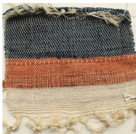
Fig. 10 Handwoven sample of plain weave using Gaddi wool