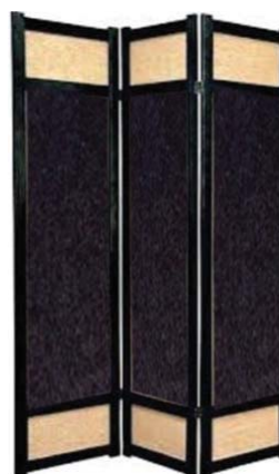
Fig. 17 Folding screen using black Deccani wool Gongadi