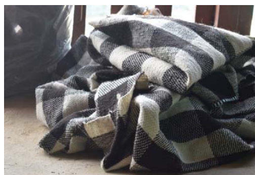
Fig. 4 Black and White Pottu—handspun and handwoven Photograph taken at Saho Valley, Chamba

predominantly the Deccani variety, they are also engaged in other occupations like agriculture and weaving the Gongadi, a blanket woven using the handspun wool obtained from the Deccani sheep.