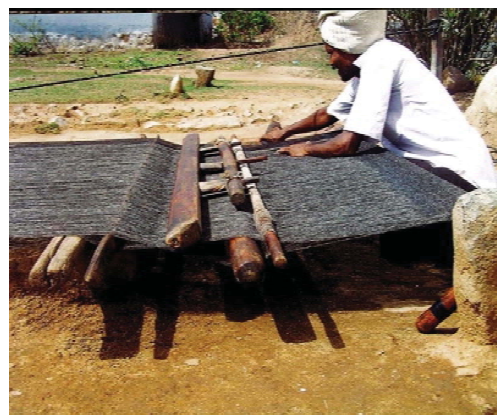
Fig. 7 Pit loom for Gongadi weaving [10]

Gongadi is woven on a pit loom which is foldable and can be kept aside when weaving for the day is finished. This type of loom is portable and well suited for the nomadic lifestyle of the pastoral communities. Yarn is filled manually in a wooden shuttle of bamboo with one end closed and an opening in the other end for filling the yarn. The loom does not have a treadle and the weaver manually lifts the sticks to insert the bobbins.