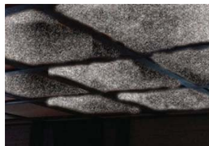
Fig. 26 Organic Gaddi wool felt fabric used in ceiling