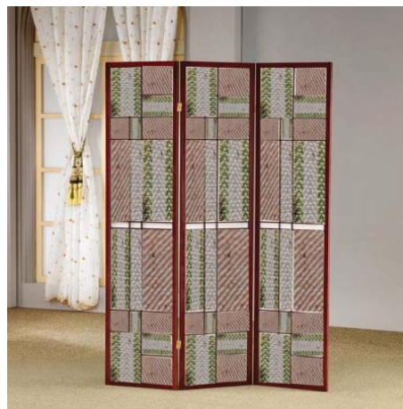
Fig. 16 Folding screen using organic Gaddi wool

The textile /fabric that is made out of the organic wool from Gaddi and Deccani sheep can be used in various forms for horizontal and vertical surfaces in modern Interiors for residential and commercial sectors. These horizontal and vertical surfaces include, false ceiling, partitions, paneling, flooring material, paneling behind bed, window blinds, upholstery, tapestry etc. It can be used to create folding screens that act as dividers between two rooms.