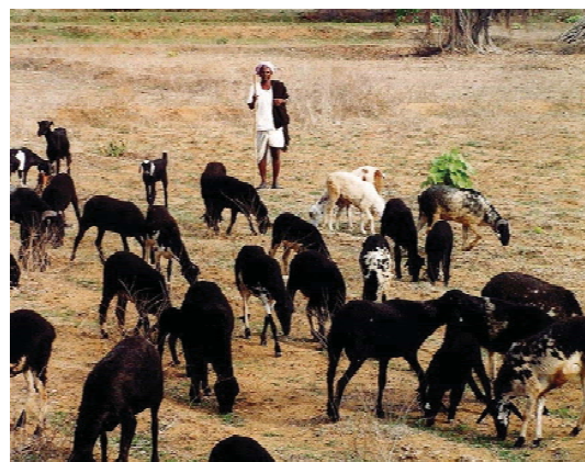
Fig. 5 Kuruma shepherd with Deccani sheep flock [10]

The Deccani breed of sheep is very well adapted to its local climate, where the temperature ranges from 8 degrees Celsius to 45 degrees Celsius. The coarse nature of the fleece helps to weather such temperature variations, and also the rains and the cold season in the semi-arid regions of Telangana and other neighboring areas. The sheep breed is extant in a large area spread across the states of Telangana, Andhra Pradesh, Karnataka and Maharashtra (some of the communities are sedentary/settled and some of them are migratory groups). Grazing for sheep is generally done on common property resources and harvested agricultural fields post-harvesting. Where there are no common grazing areas, the shepherds take grazing land from the local farmers on lease. The farmers benefit by this arrangement as the sheep droppings are a rich source of nutrients for the soil, and they pay the herders money or barter with food-grains in return [9].