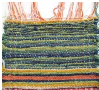
Fig. 12 Handwoven sample of satin weave with Gaddi wool