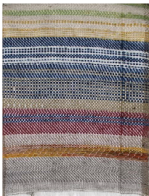
Fig. 11 Handwoven sample with Gaddi wool