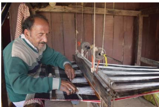
Fig. 3 Gaddi loom in black and white wool (Saho Valley, Chamba)

The traditional loom is housed on the upper floors of a Gaddi dwelling. The shuttle is long and hollow and the weft yarn is inserted manually. The fabric is woven in plain weaves in single colors. Traditionally, the fabric has flat weaves, and is of a single color. To add some ornamentation, stripes and checks might also be woven sometimes. The weaves are generally wool in both warp and weft, but sometimes Khadi cotton overlaid with wool can also be used, and warps of Khadi could also be teamed with wool wefts.