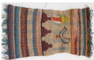
Fig. 13 Handwoven sample of tapestry using Gaddi wool