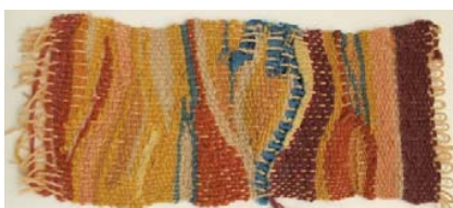
Fig. 14 Handwoven sample of tapestry using Gaddi wool