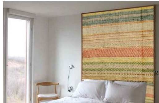
Fig. 24 Organic Gaddi Wool as wall paneling