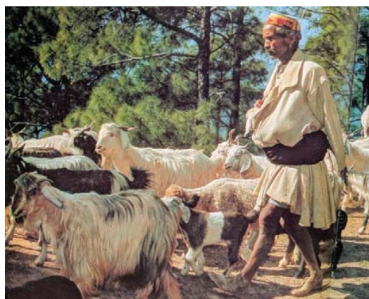
Fig. 1 Gaddi shepherd wearing Cholu with Dora [20]

Gaddi menfolk wear a knee length felted garment called the Cholu which is made up of the ecru-colored, sturdy fabric called the "Pattu" (Made of organic wool sourced from Gaddi sheep and handspun and handwoven). The Cholu costume lasts for a long time, and is passed from one generation to the next.