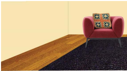
Fig. 20 Organic Deccani Sheep wool as carpet