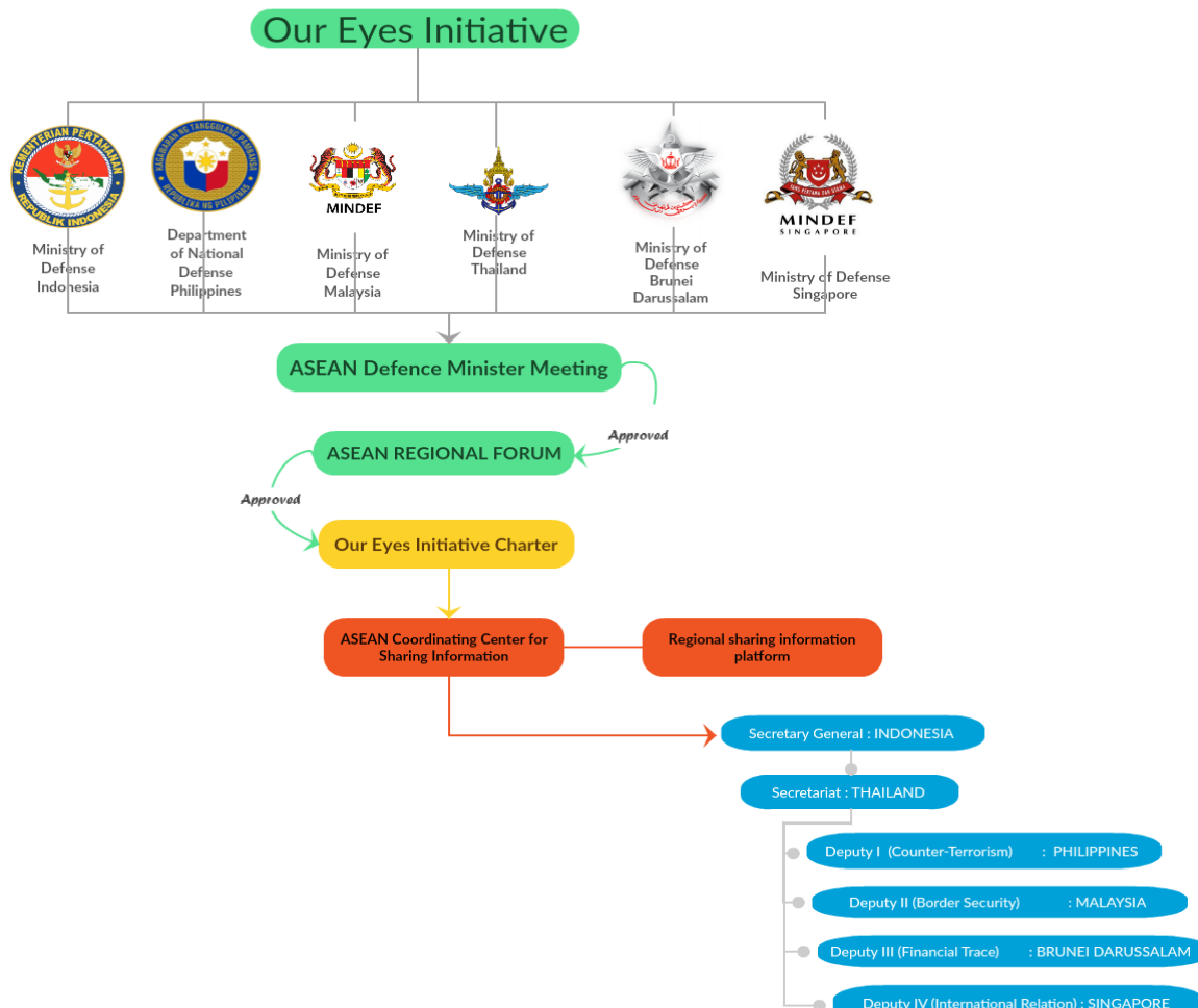
Fig. 1 Optimization Our Eyes Initiative by making it as a Regional Cooperation

Other regional countries like Vietnam, Myanmar, Cambodia and Laos would be welcome to join as a member of OEI; however, they will be the subject of Our Eyes Initiative Charter . These nations must ensure they fully observe the guidelines established under the agreement and openly provide information about all aspects of terrorism threats in the interests of this regional cooperation.