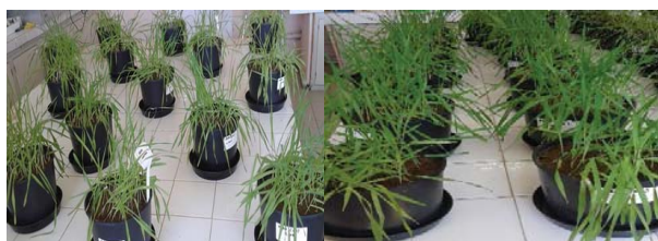
Fig. 1 A general view of pot experiment

This pot experiment was done greenhouse conditions in Namık Kemal University, Agricultural Faculty, Department of Soil Science and Plant Nutrition. Experiment was conducted according to Randomized Block experiment design with three replicates. Barley ( Hordeum vulgare L.) plant was used in this research for test plant. Cadmium (100 mg/kg) was applied as \text{CdSO}_4 \cdot 8\text{H}_2\text{O} forms to each pot and pots incubated during 30 days. Ethylenediaminetetraacetic acid (EDTA) chelate was applied to each pot at five doses (0, 3, 6, 8 and 10 mmol/kg) 20 days before harvesting time. Plants were harvested after two months planting. A general view of pot experiment in Fig. 1. Then plant samples were prepared for analysis and Cd and Zn concentration of plant samples were determined ICP- OES instruments [6]. Variance analyses were done between Cd and Zn concentration of plant green part. Also, pH, EC, organic matter amount, available phosphorus, exchangeable potassium, lime [7], available some trace elements (Fe, Zn, Cu and Mn), exchangeable Cd contents and texture class [8] of soil sample were analysed. Some physical and chemical properties of soil samples are given in Table I.