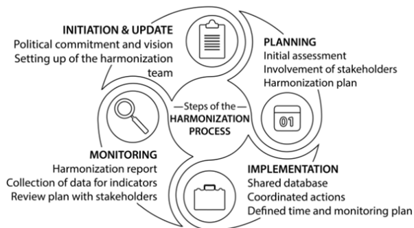
Fig. 2 Steps of the Harmonization Process. Diagram adapted from the original one in the Guidelines

The second chapter corresponds to the harmonization process itself and includes the necessary information to follow the four steps in order to achieve the harmonization of energy and mobility plans. Fig. 2 presents the four steps, initiating with the confirmation of political commitment and the setting up of the harmonization team, continuing with the planning stages, the implementation and finalizing with the monitoring and controlling of the harmonization process. This chapter concludes with some recommendations for an intermediate stage of updating and continuation of the harmonized plans, setting up the basis for a new cycle.