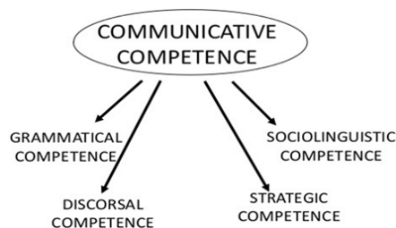
Fig. 1 CC components