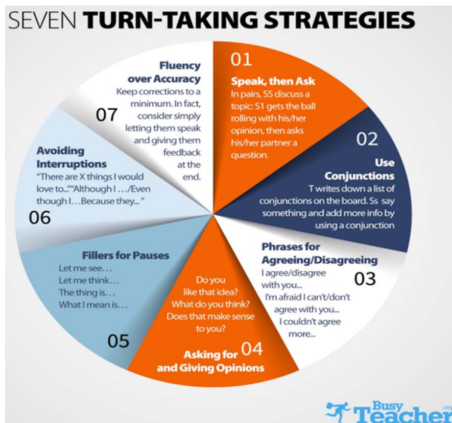
Fig. 4 Seven Turn-taking strategies for EFL speaking modules [65]

research, all suggest the explicit teaching of pragmatics, SAT, CP, and Turn-taking rules. In [64], a very thorough description of how turn taking techniques are employed. Moreover, [65] suggested seven steps/ strategies as to what to use and how in a speaking module (see Fig. 4). An online interactive website for the teaching of speaking [66].