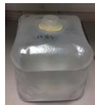
Fig. 1 5-L proficiency test samples contained in plastic bottle

The proficiency test sample was 5-L of seawater containing ^3\text{H} , ^{60}\text{Co} , ^{134}\text{Cs} , ^{137}\text{Cs} , and ^{90}\text{Sr} which was received from the IAEA. The sample was of unknown activity and was used as test case for the determination of its ^{60}\text{Co} , ^{134}\text{Cs} , ^{137}\text{Cs} and ^{90}\text{Sr} activities. The analysis results were submitted to the IAEA to evaluate accuracy and quality control. The PT sample is shown in Fig. 1.