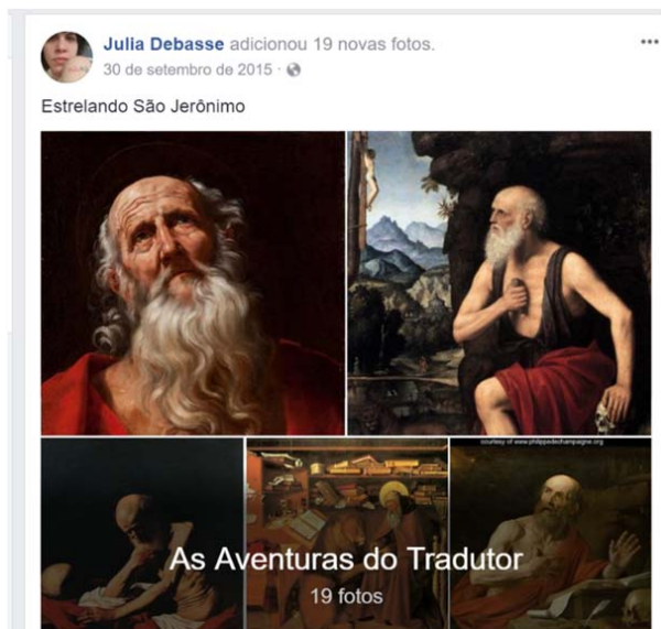
Fig. 2 Image collage and subtitles by Julia Debasse, available on the Group Translators / Interpreters

two groups, because, besides the fact of giving voice to translators, the groups also shine light over the profession's need for more appreciation. There is a "self-declaration" of being a translator and an attention to showing that the professionals do not only know how to translate, but also know how to discuss and defend their profession.