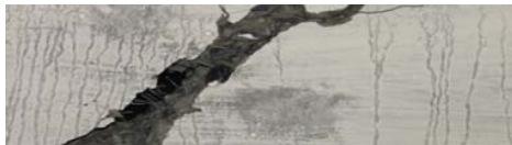
Fig. 1 Fibres stitching of a diagonal crack

\rho_w - transverse reinforcement ratio, \rho_f - fibre content, P_d - Diagonal Cracking Load, P_u - Ultimate Load. Notation of failure modes: S- Shear; F- Flexure; F- S Flexure and Shear