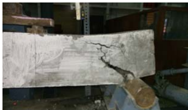
Fig. 2 Brittle shear failure (without steel fibres)