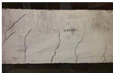
Fig. 3 Ductile Flexural (with steel fibres)

From the load-deflection curves, it can be seen that the behaviour of the beams without stirrups and reinforced with steel fibres is identical to that of the beams with stirrups and