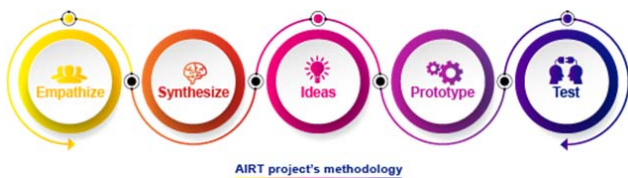
Fig. 1 Detail of the Design Thinking methodology used in the AiRT project.