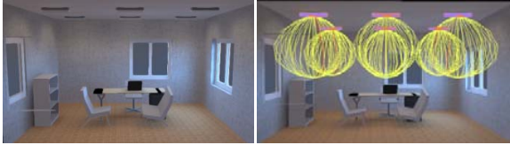
Fig. 3 Results of simulation of the illumination of the Bureau 1

Nth: Number of luminaires required theoretically. N Dialux: Number of luminaires found by the DIALux Evo software.