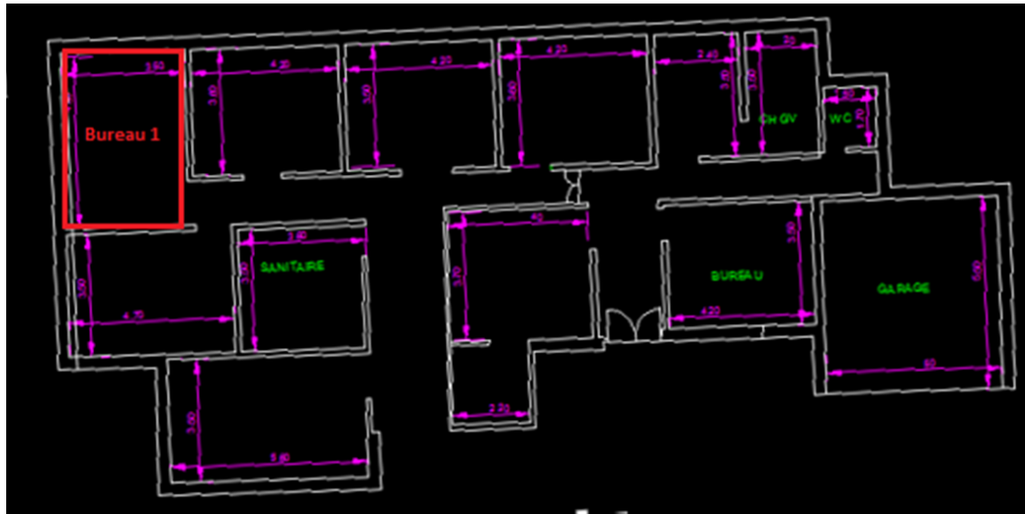
Fig. 2 Architectural building plan