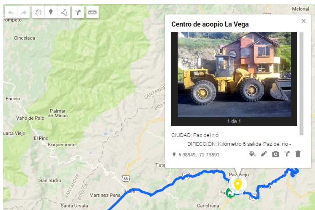
Fig. 2 Characterization of a collection center

The definition of candidates lots for location of collection centers was the result of a preliminary study by the directors, which established that these locations are found in the northern region of the department of Boyacá. The fixed cost of installation was calculated according to the value of commercial lease for square meter.