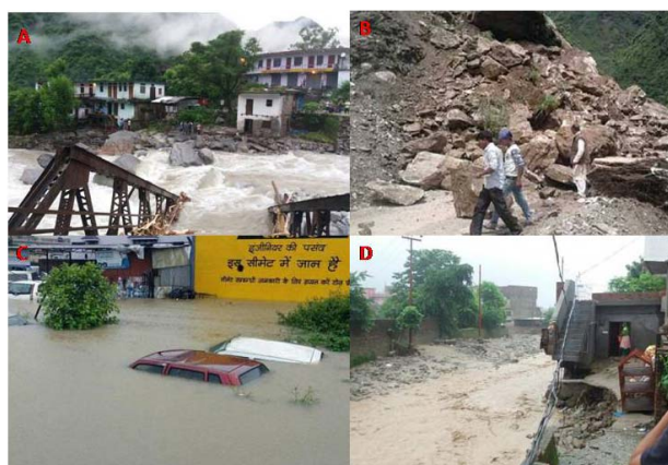
Fig. 2 A. Bridge collapsed due to flashfloods in Kanar village, Pithoragarh; B. Huge landslide on the Gangotri pilgrimage road; C. Roads are over flooded due to cloudburst-triggered floods in Dehradun city; D. Houses collapsed along the seasonal Nala in Kotdwar due to cloudburst (All these incidences occurred in the second week of August 2017)

In the second week of August 2017, cloudburst-triggered flashfloods and landslides have devastated Malpa village, Kotdwar town, and Dehradun city where a number of people died and huge property was damaged (Fig. 2).