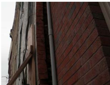
Fig. 2 New plumb wall next to old bulged brick

New construction can expose ongoing deterioration and bulging brickwork. Where bulging brickwork extends across multiple buildings, renovating the front façade of one of the buildings can expose the extent of movement on neighboring structures. A new, plumb front facade on a renovated building makes the extent of movement on a neighboring building's bulged front brick façade suddenly apparent. The sudden discovery of bulging brick may be incorrectly blamed on renovation efforts on the neighboring building.