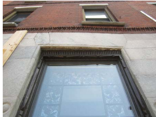
Fig. 3 Bulge at window opening

Structural brick walls often bulge around door and window openings. As brickwork bulges, gaps open up around windows and doors. These gaps are typically not uniform and taper down following the bulging brick. Over the years, patch repairs to the building will often include filling gaps in between the door and window openings and the bulging brick with mortar or caulk. Evidence of such previous repairs often remain even on collapsed brickwork and can be used to help determine whether a brick façade was bulging when it collapsed.