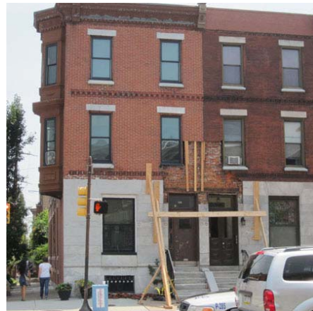
Fig. 1 Brick wall damage

Structural engineers are often hired to assess brick building damage. A damage assessment requested by an insurance company, real estate agent or buyer may come with little background information on the subject building. When there is limited knowledge of the building and building history, the structural engineer must evaluate the brick construction method as part of the assessment.