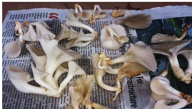
Fig. 2 Freshly Harvested Fruit Bodies of P. ostreatus 26 Days after Spawn Inoculation

(13.75), highest mean CD (5.64c m), highest FW (51.01 g), highest BE (102.02%) and highest PR (4.09 g per day). Significant differences ( P \leq 0.05 ) were observed in CD, FW, BE and PR among the evaluated sterilization methods.