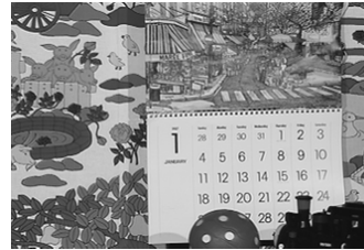
(a) Original (Mobile sequence, frame #1)

Tables I and II show the number of operations required for the transform and matching criteria computation stages of the low-complexity ME approaches per pixel, respectively. As seen from Table I, the proposed approach has the lowest binarization cost similar to the C-1BT based ME [4], whereas the EC-1BT based ME approach in [6] has the highest computational cost at this stage. When the matching stage computational complexity is assessed, the proposed approach has similar complexity with the W-C1BT based ME and it has considerably lower complexity than the method in [6]. It is clear that the multiplication operation for the suggested matching criterion could be implemented as a simple fetch from a look up table (LUT).