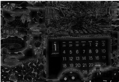
(d) Proposed approach constraint mask (8-bit depth)