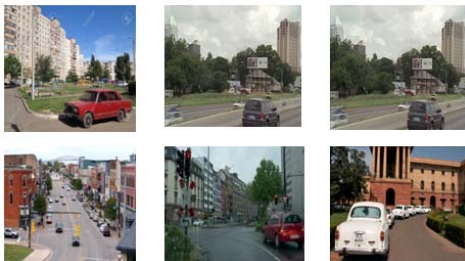
Fig. 2 Sample Input Images

The Sun Databases dataset contains 60 images for training and 30 images for testing. Images on the database are captured from various places (highway, urban, rural) and during various times (morning, afternoon, etc.). The dataset contains more than 100 road environment images from different categories. Three main categories of road environment are buildings, cars and trees which are selected as the target classes in competition and in our experiments. The resolutions of the images vary from 126 x 126 pixels to 1286 x 1286 pixels. Finally, all the images are resized into the common pixel level as 256 x 256. Some of the road environment images are shown in Fig. 2.