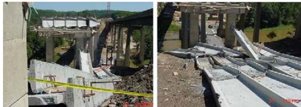
(b) I-80 in Clearfield County, Pennsylvania [2]