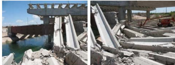
(a) Power Road, Red Mountain Freeway in Mesa, Arizona [1]

a primary mode of failure in concrete construction.