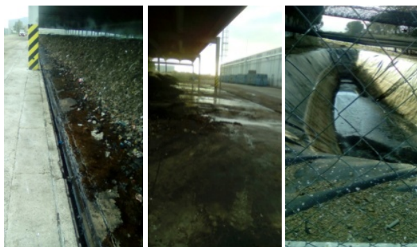
Fig. 1 Leachate generation in waste accumulation areas

Landfills and waste treatment centres generates atmospheric emissions (greenhouse gases) and also a very polluting liquid fraction called leachate (Fig. 1).