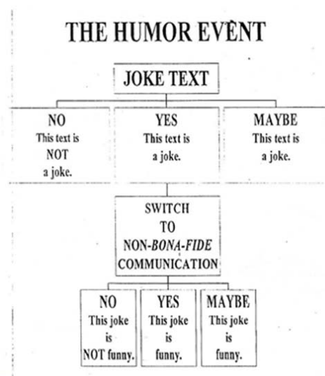
Fig. 3 Audience based theory where humor identification, comprehension and appreciation take place in the humor event [77]