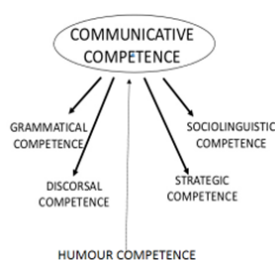
Fig. 4 Description of the humour competence added as a fifth component in communicative competence [35].