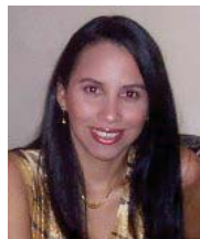
Networks and Computer Security.