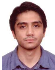
His main research interests are Multimedia Forensic and Information Security.