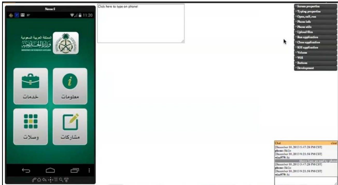
Fig. 1 Shows the tested phone on the computer's screen.

Applications that are designed to one group of users were used in order to make the reliance on the rating given to the three applications more accurate. Furthermore, government applications were selected since the researchers believe that no one would be interested to change the rating of those applications.