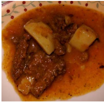
Fig. 6 Sample 2 in potato curry preparation