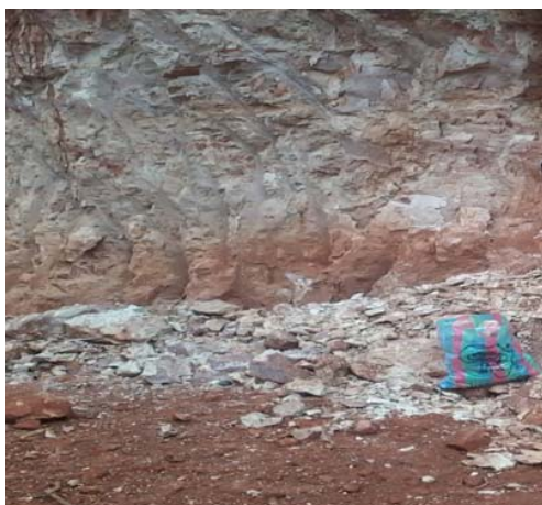
Fig. 1 Location and collection of the kaolinite clay at the site

The kaolinite clay was sourced from deposits along Abeokuta-Ajebo Road, Abeokuta, Ogun state (789400 mN, 548209 mE). The deposit was located at a depth ranging from about 10 meters from the ground level (Fig. 1). Samples were collected from the site and tested. Tests carried out on the samples of the kaolinite clay include XRD, DSC, and pozzolanity tests.