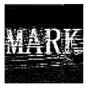
Fig. 10 5,0.5