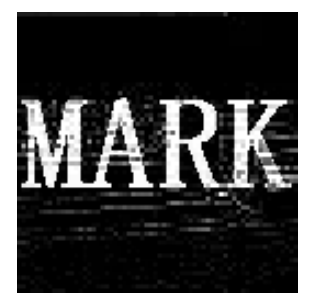
Fig. 14 Frames