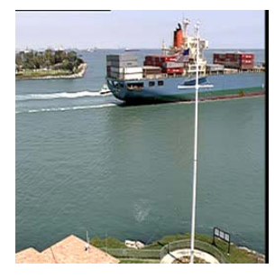
Fig. 2 Original video frame

The imperceptibility requires visual imperceptible of watermark. This paper embedded image watermark into video. Judged subjectively, the quality of carrier image and watermark almost didn't deteriorate, as shown in Figs. 2-5.