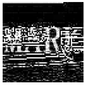
Fig. 11 5,0.8