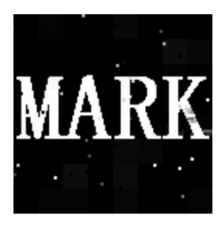
Fig. 6 Noise 0.001

Figs. 7-9. Gaussian filter is a process of taking weighted average of the whole image; every pixel value is determined by taking weighted average of its own and other neighboring pixel values. Gaussian coefficient is 5, 0.2; 5, 0.5; 5, 0.8, as shown in Figs. 10-12. Frame deletion attack is a situation of losing one or more frames during the process of compression, shear or transmission. It will cause great damage to original video sequences and loss data. In this paper, we randomly deleted the 5, 10, 15 frame of video sequence to finish the experiment, as shown in Figs. 12-14 [8].