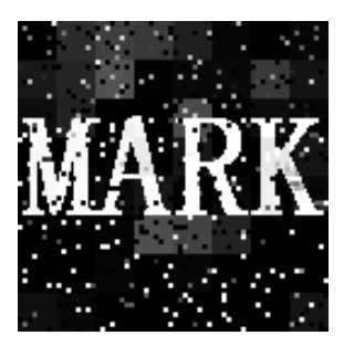
Fig. 8 Noise 0.01