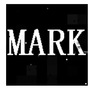
Fig. 13 Frame