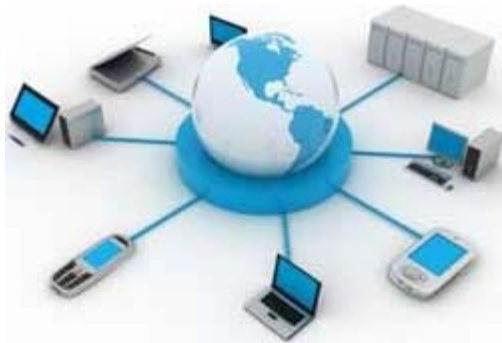
Fig. 2 Service users using diverse computing tools [5]