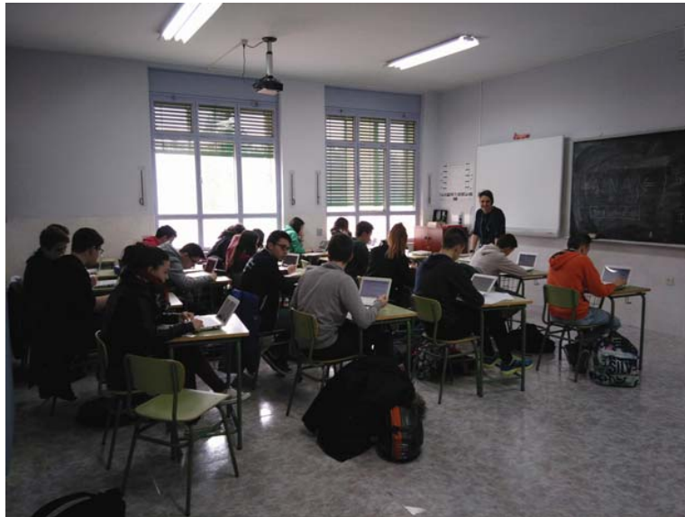
Fig. 3 Picture of research done in Las Viñas Secondary School

Solve the following classroom situation by using AINA application: