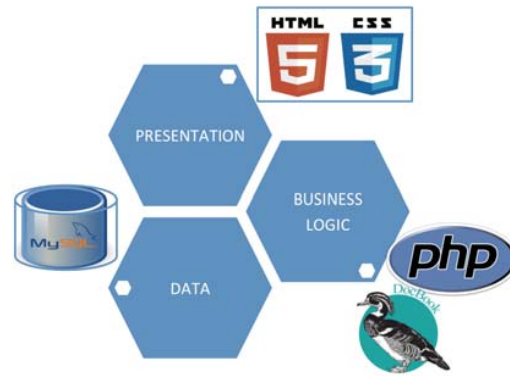
Fig. 1 AINA's Architecture

In order to gather the information about Disney movies, the information system should satisfy the following requirements: (i) Centralization: Students should be able to access all the