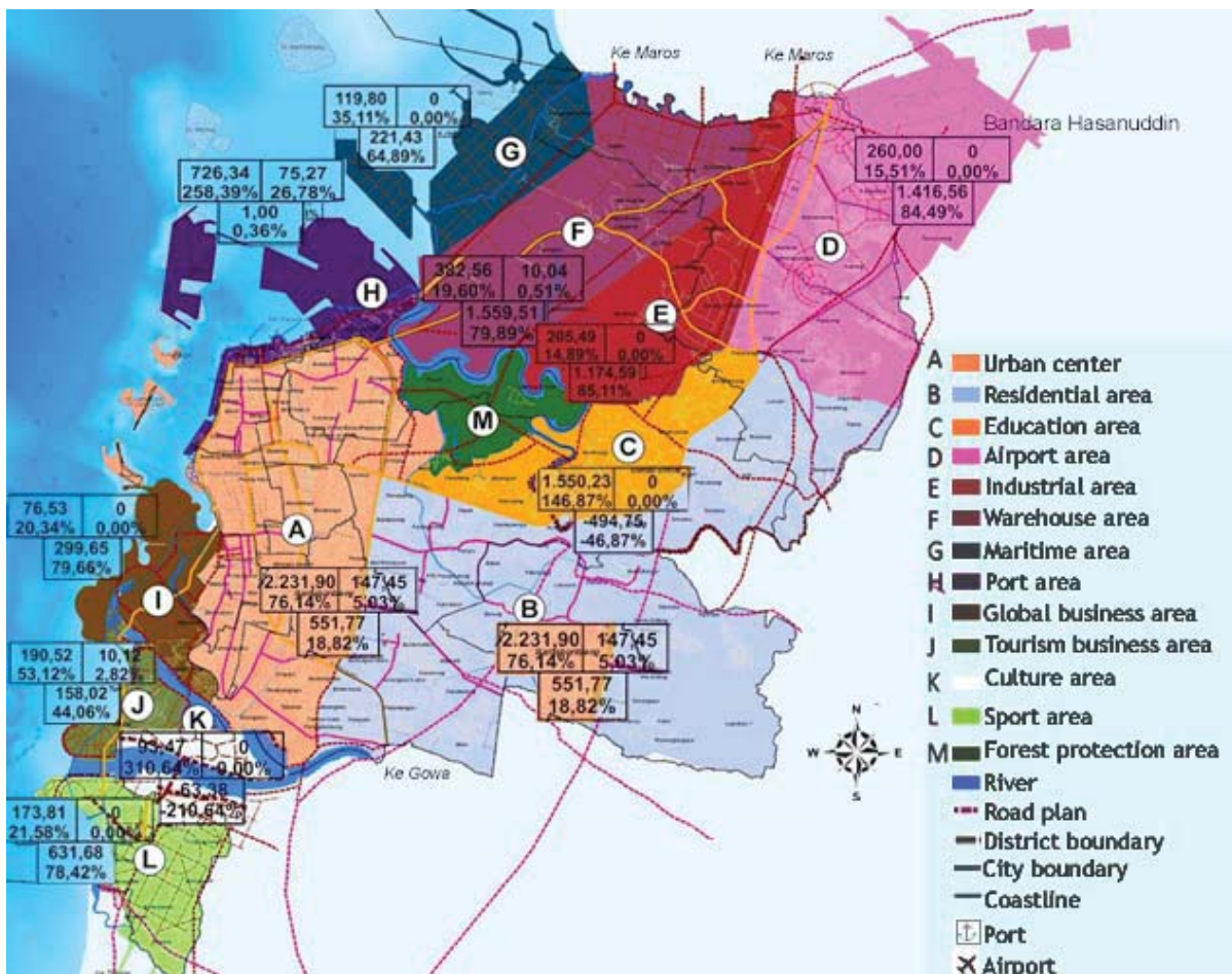
Fig. 2 Official land use maps of Makassar city government [19]