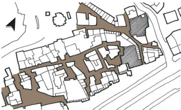
Fig. 6 Layout of the outdoor spaces of old Yanbu

It has been a conscious decision to use the word 'settlement' instead of 'city' while referring to the traditionally built-environment of Saudi Arabia. It is but pedantic, explaining the sense of how and when settlements began to be called 'cities'- planning jargon. 'City' associates with itself a service hierarchy or degree of interaction with higher and lower order cities as classified under the order of the cities in planning system. Whereas pre-modern Arabian settlements were resolutely isolated and self-sustaining organisms that did not quite orientate itself within a such planning hierarchy. Furthermore, even current cities have not yet aligned in absolute terms with this order, though they are all planned with that sense. However, right this might be, it leaves scope for another research.