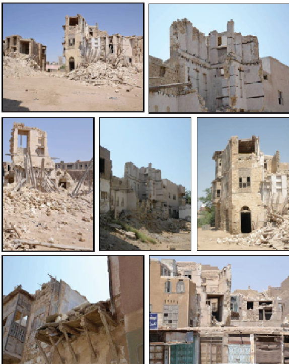
Fig. 2 Photographs showing the current physical conditions of Old Yanbu