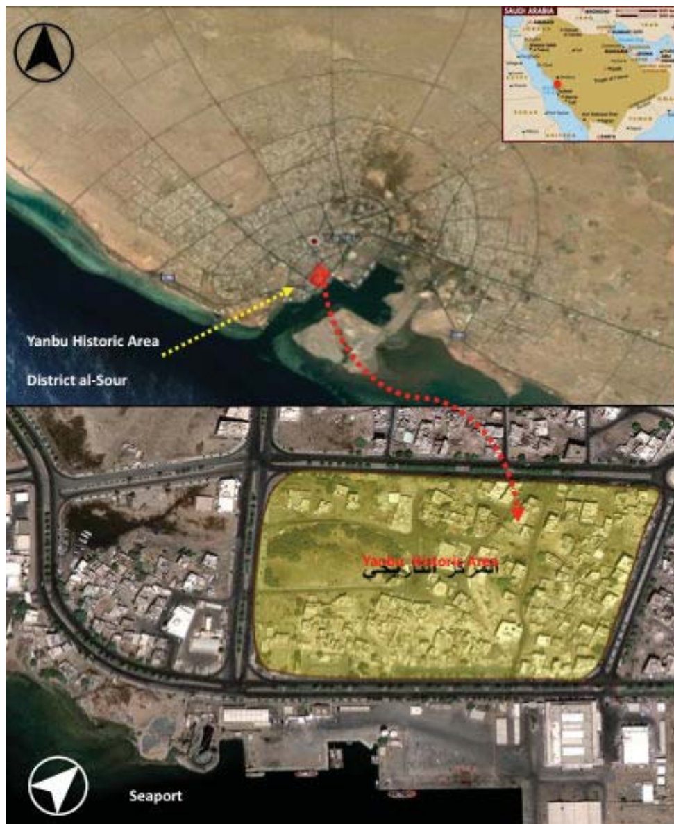
Fig. 1 The location of historic area relative to Yanbu Industrial City [1]

coupled with negligence, has led to deterioration of old city areas, delinking the society with its building traditions (Fig. 2). It is here, to suggest that necessary as they were, this transition need not have to be so brisk, compensating for the traditional character and diversity completely (something that locals connected with); and that old models had much more to offer than was learnt from it. Besides exterior forms and intricate motifs, it offered more accessibility to its population despite its non-institutional structure, justified diversity, was humane, maintained unity and human development. In the face of rising scale and homogeneity, the study of such a traditional system thus, can essentially be of any merit, only for its principals rather than its immediate forms [4].