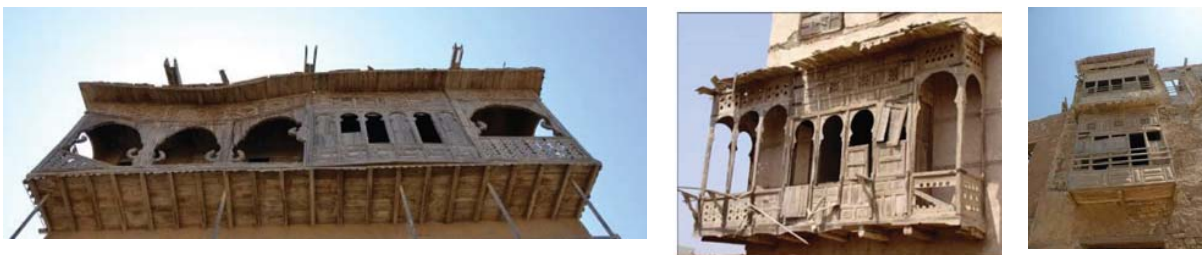
Fig. 5 Examples of Yanbu's Rowshans

Under the politics of tribal culture, a defensive wall with turrets was erected covering the extent of the residential districts as a whole. It accorded esteem along with security to the inhabitants (Burton notes people boasting of its strength). Moreover, it also distinguished the settlement as 'urban' for its regulated developments while fencing it from the assaults of nomadic tribes that comported different lifestyle. Eight residential districts are recognized to have existed, namely Khareek, Al Saida, Al-Quad, Al-Assor, al- Mangara, Abbas, Refaa, and al-Rabghi. Of all, only the Al-Asoor district could be realized before complete diminution.