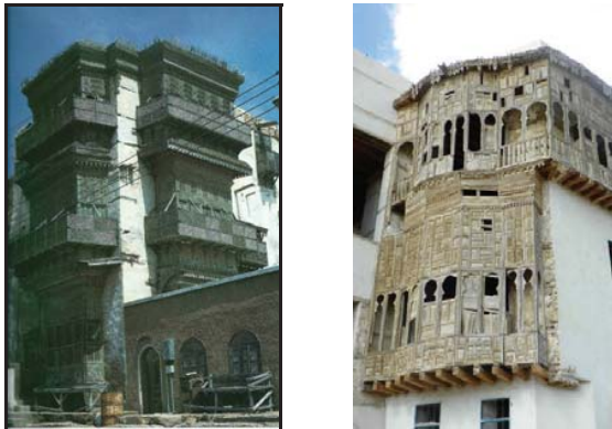
Fig. 3 Examples of Yanbu's traditional buildings [8]

of security from the natural defensive surroundings. The scarce remains of old Yanbu include some buildings in Haret Asoor, and the Souq Al-Lail (Al-Lail Market) [9] (Fig. 4).