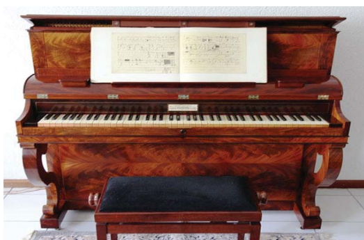
Fig. 3 The author's pianino n°13153, August 1846 [21]