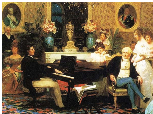
Fig. 2 Chopin plays piano in Radziwiłł's Berlin salon, Berlin, Henryk Siemiradzki, 1887 [20]

Moreover, we refer to nocturnes, in the plural, "as one of essential forms of a salon music" [8], which bring out a strong emotional response in the public. There is a narrative inconsistency in a melancholy perspective that may account for the strong criticism that surrounds this popular music. It is almost a sort of Preludes seen as the culmination of a Romantic aesthetics or something that surpasses these aesthetics towards a modern path. Preludes are also called the melancholy pieces comprised by an American literary realism [9].