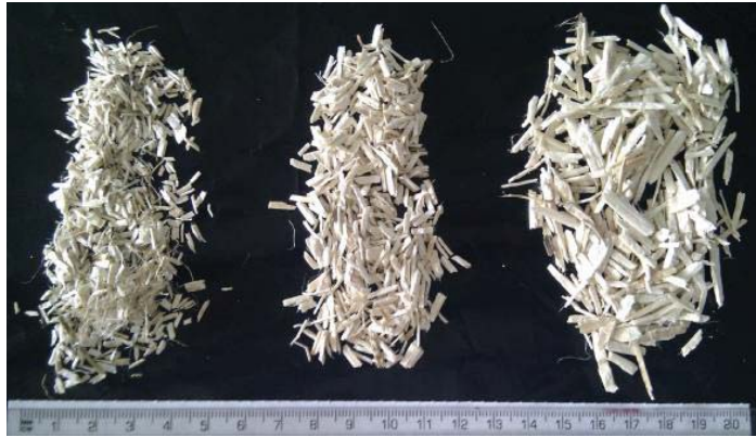
Fig. 1 Hemp particles of varied scale

Acoustic absorption was tested on hemp lime wall sections in a laboratory with minimal background noise. Details of the materials and testing procedure are outlined below.