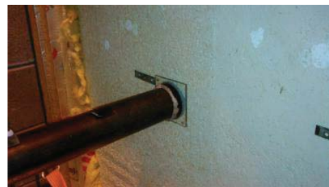
Fig. 2 Impedance tube contacting section of hemp-GGBS wall