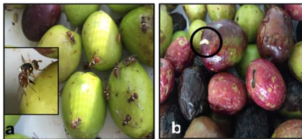
Fig. 2 Establishment of a laboratory colony using different olive cultivars (a) oviposition into different cultivars and (b) larva exits fruits