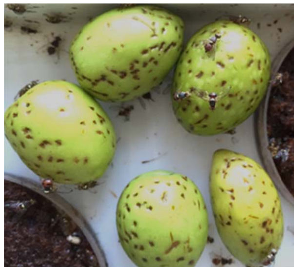
Fig. 5 Oviposition stings of olive fruit fly on different olive varieties

Several studies showed that there was a correlation between oviposition preference, larval performance and cultivars [2], [5], [7], [20], [21], [23]. It is also known that olive fruit fly females have a critical role in the selection of the olive varieties, in olive infestation and the phenological stage of the olive fruit [2]. Previous studies referred that the colour of the fruit was also important to choose the oviposition sites among the cultivar in the same olive orchards [2], [5], [7]. Olive fly females prefer varieties having bigger fruits than smaller ones; however, some studies showed that size of the fruit is not a key factor determining ovipositional preferences [2].