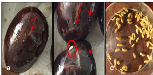
Fig. 3 Larval development inside the olive fruits (a) partially visible larva feeding inside the fruit, (b) mature larvae marked with red circle and red arrows indicate the exit holes (c) mature larvae and pupae

The healthy and untreated olive fruits from different olive varieties were collected from the experimental olive orchard (Fig. 1) to use for both colony maintenance and set up the experiments. Adult flies were placed in plastic and fine mesh screen cages (30 x 30 x 30 in dimension) provided with adult food and water supply [6]. Established laboratory colony of adults was shown in below. Females of the flies deposit eggs individually inside the olive fruits (Fig. 2 (a)) after three instars, the larva exits from the fruit (Fig. 2 (b)). Several olive