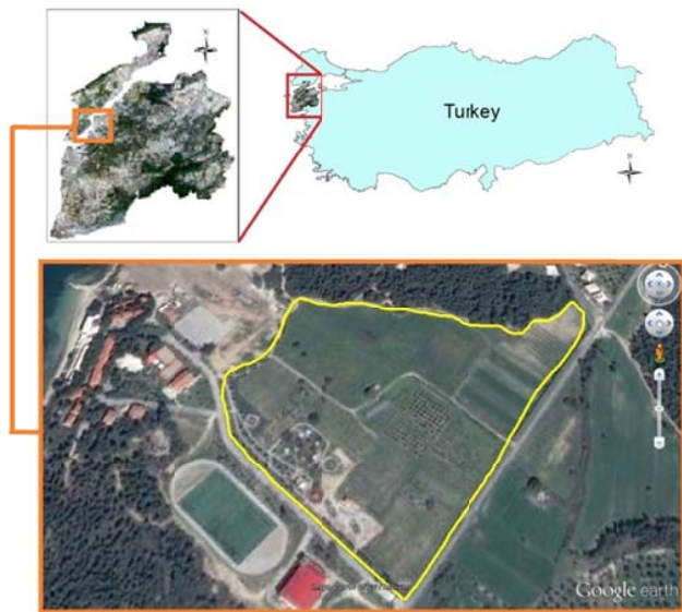
Fig. 1 Experimental olive orchard- Campus of Dardanos, Çanakkale Onsekiz Mart University