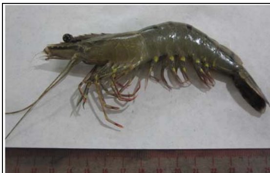
Fig. 7 Penaeus monodon