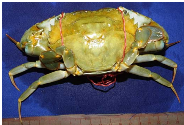
Fig. 13 Scylla serrata