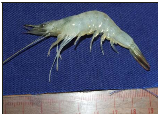
Fig. 8 Penaeus indicus