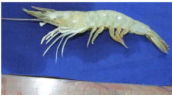
Fig. 11 Metapenaeus monoceros