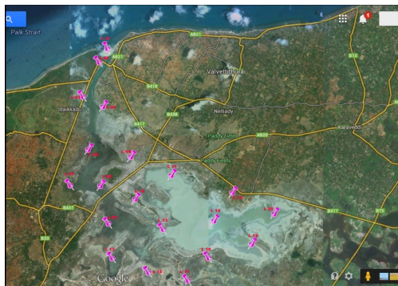
Fig. 1 Location of the Thondamanaru lagoon

Thondamanaru lagoon was selected for this study (Fig. 1). Similar to most other lagoons and estuaries in Sri Lanka, Thondamanaru lagoon also supports profitable shellfish and finfish fisheries. Thondamanaru lagoon lies approximately between 80°08'E–80°29' E longitudes and 9°34' N – 9°49' N latitudes [3], [7]. Thondamanaru lagoon is shallow tidal lagoon and its northwestern end is connected with Indian Ocean by narrow channel that is temporarily covered by sand bar [1].