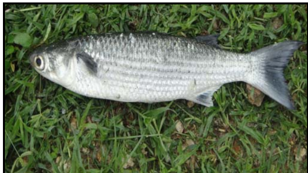
Fig. 6 Mugil cephalus