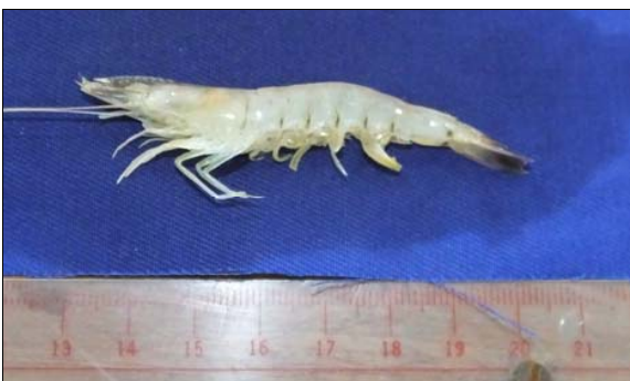
Fig. 9 Penaeus latisulcatus