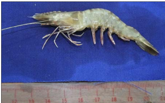
Fig. 10 Penaeus semisulcatus