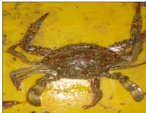
Fig. 12 Portunus pelagicus