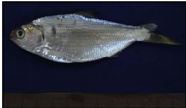
Fig. 5 Nematalosa sp.