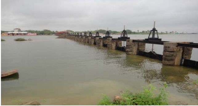
Fig. 2 Existing structures of the Thondamanaru lagoon

Randomly collected samples were placed in polythene bags. All collected specimens were brought to the laboratory in an ice box and analyzed.