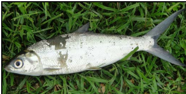
Fig. 3 Chanos chanos