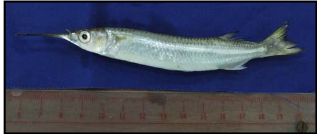
Fig. 4 Hemirhamphus sp.