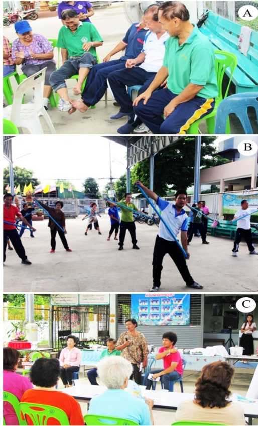
Fig. 2 The activity tasks for achieving elderly health care development; A. Social engagement B. Physical activity C. Cognitive stimulation