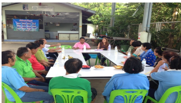
Fig. 1 Focus group meeting and interviews sharing in Paisanee Ramintra 65 Bang Khen region, Bangkok, Thailand

Assessment questionnaires, self-reported measures, in depth interviews and focus groups meetings and interviews (Fig. 1) are important techniques for CBPR. The results often offer valuable insights on the health of an understudied population. In addition, all techniques are well suited to explore health problems in a community which is poorly known in Paisanee Ramintra 65 aging population.